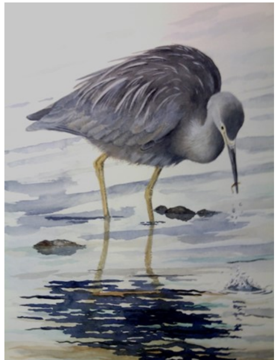
White faced heron