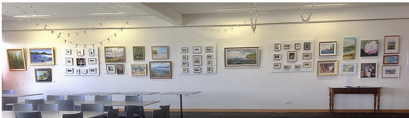
A previous Heritage Art Group exhibition showing the variety of artworks on display.