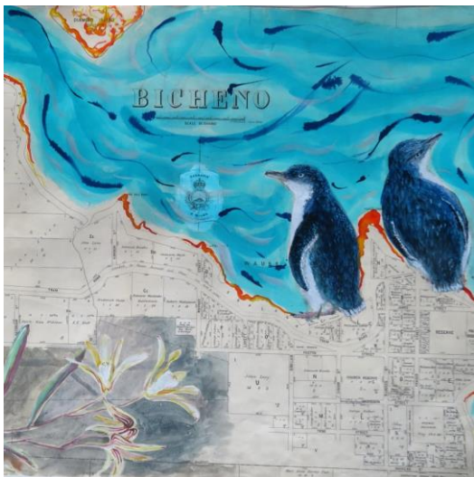
Mixed media - ink, watercolour, acrylic. Penguins and dokrillia on bicheno map