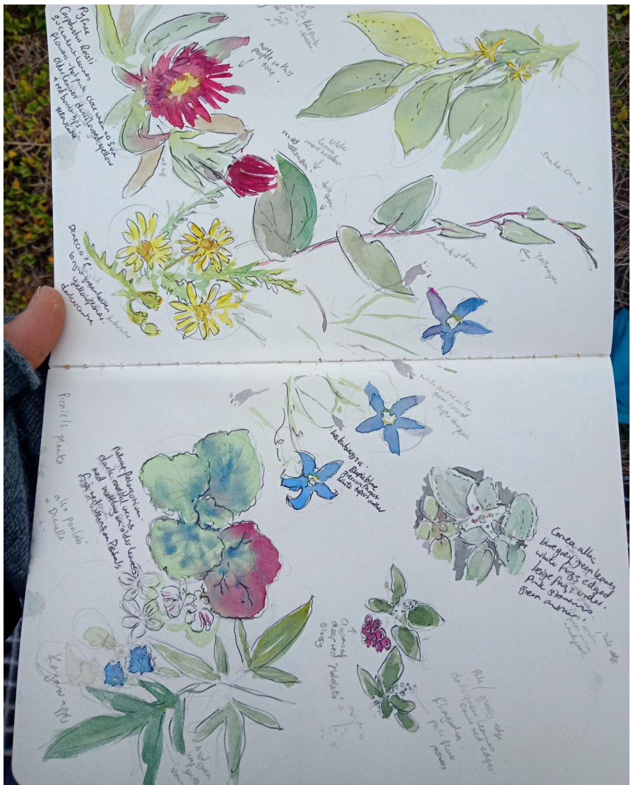
Mixed media plant sketches. Watercolour and ink.